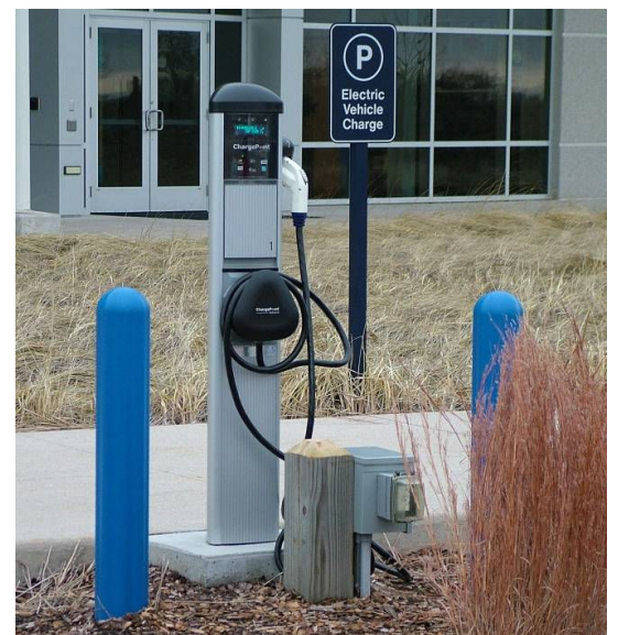
Electric vehicle charging station