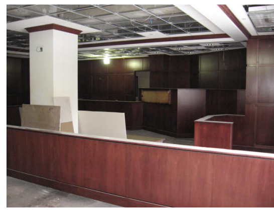
Courtroom construction at the Hall of Justice