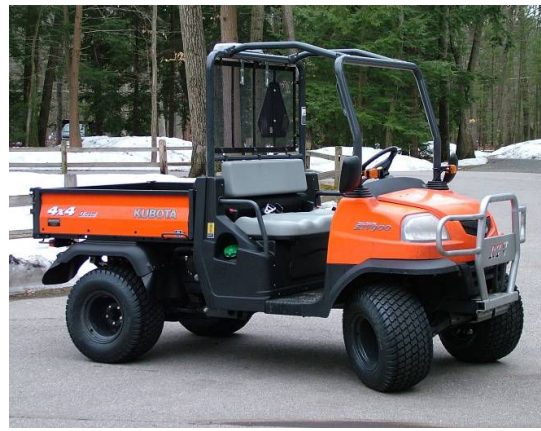
New Kubota utility vehicle at Parks