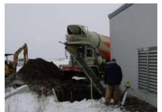
Pouring the communications tower base at our landfill compressor building