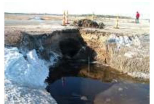
Culvert failure under south Swanson Road