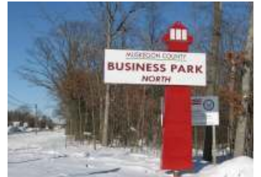
New business park sign