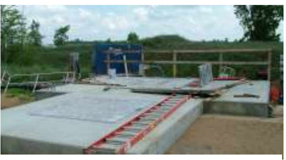
New concrete pad at Laketon Station