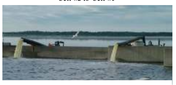
Water being pumped from the storage lagoon to add oxygen to Cell #4