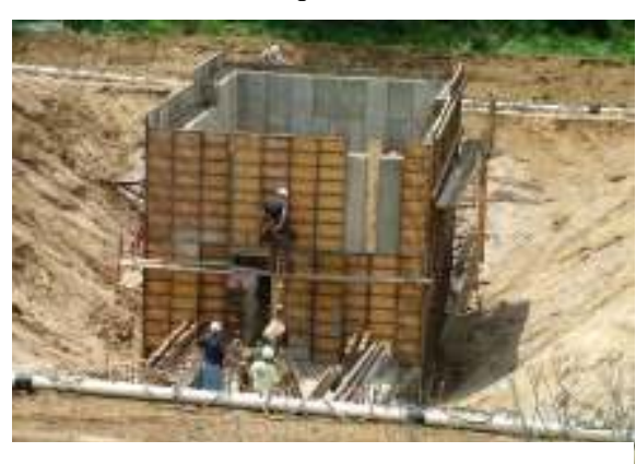
Walls poured at Sullivan Station