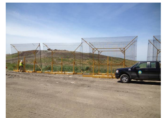
Wind screens being assembled at Solid Waste