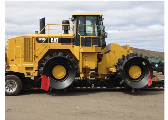
The new Cat 826H compactor is now in service at Solid Waste