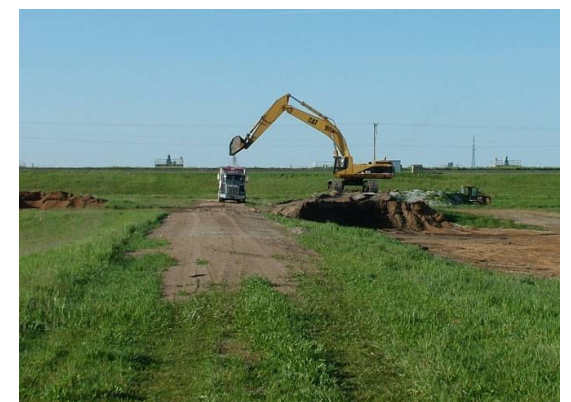
Sludge being hauled from the Wastewater drying beds