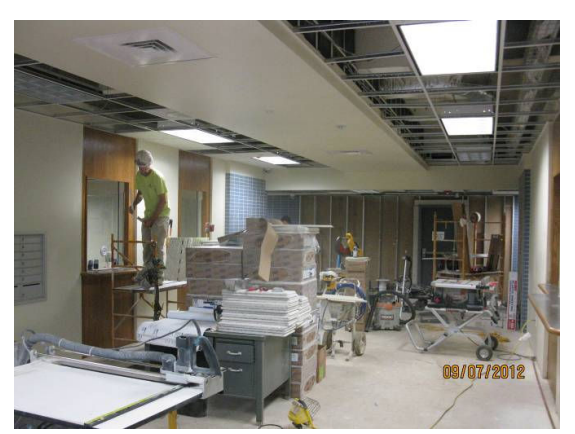
Renovation work on the first floor of the Hall of Justice