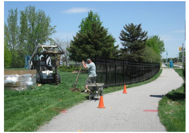
The new aluminum picket fence being installed at Heritage Landing