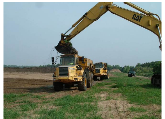
Work continues on the flow-through marsh project on the Wastewater site