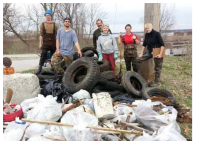
Trash from the mouth of Ruddiman Creek