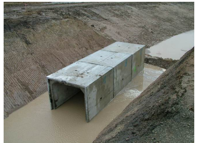
A box culvert being installed under Swanson Road as part of the marsh project