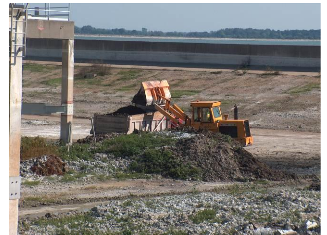
Dry sludge being removed from Cell #2 at Wastewater and transported to Solid Waste