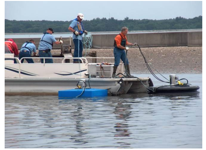
Micro bubble diffusion aerators being installed in Cell #4 at Wastewater for a 3-month study