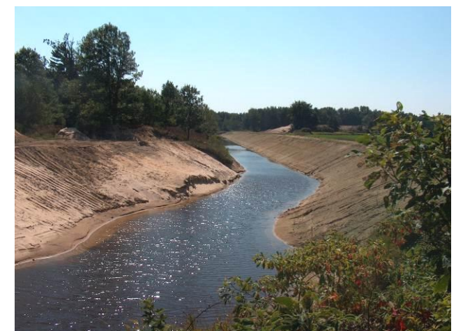
Work is continuing on the flow-through marsh project