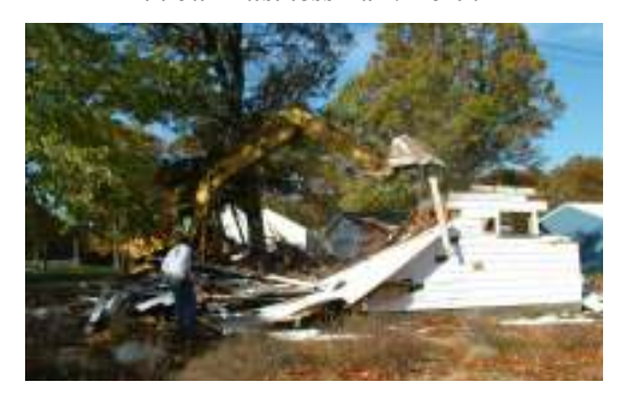
Watts Trucking tears down the last house at the MacArthur Road break site