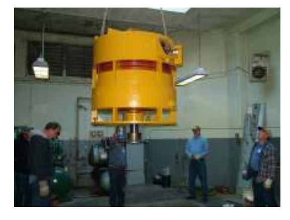
1,250 horsepower pump motor being placed back in old C Station