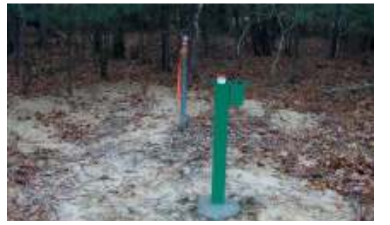
New monitoring well at old Whitehall Plant