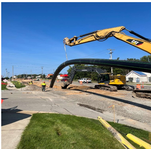
W Station Force Main Replacement: Installing fused HDPE pipe (22" O.D.) on Colby Road in Whitehall.

Kamminga & Roodvoets (K&R) is working fast to complete the W Force Main Replacement project before winter strikes. Tentative completion date is November 17, 2023.