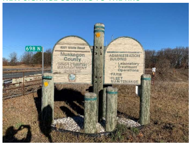
Goodbye old friend... keep your eyes open for the new sign to be installed in the coming months.